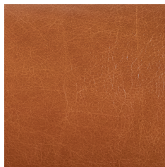
Tan Saddle Leather