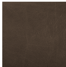
Dark Brown Saddle Leather