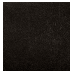
Black Saddle Leather