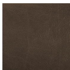
Dark Brown Saddle Leather