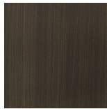
Brushed Dark Bronze