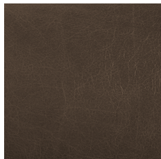
Dark Brown Saddle Leather