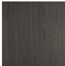
Tay Veneered Dyed Smokey Grey